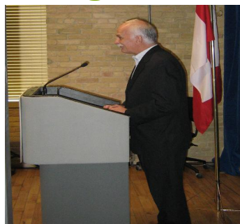
Vic Toews at a Press Conference hosted by Immigrant Centre on March 4, 2011

The two organizations approved for funding in Winnipeg are the Immigrant Centre Manitoba Inc and Manitoba Islamic Association .