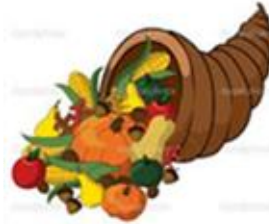
Cornucopia (Horn of Plenty)