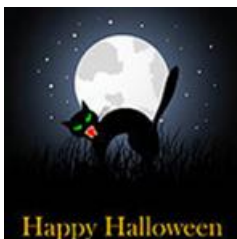
Hallowe'en or Halloween