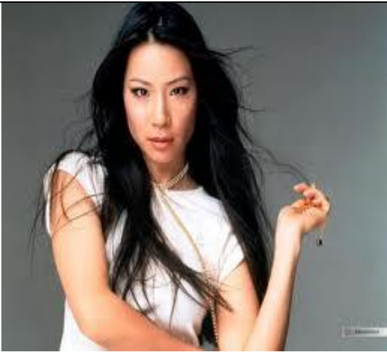
long straight hair