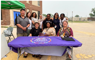
#Community Empowerment @Mt Carmel! @Seven Oaks