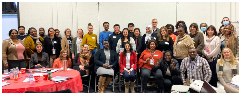
Newcomer Agencies @EmpowerMENT Project

#EmpoweringConnections #BuildingCommunities #CollaborationForChange #MakingADifference"