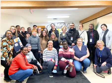
All smiles @ ECRC !

Since December 2022, the ZONE coordination has been actively conducting site visits to various locations, which were well attended by the ZONES, Mini ZONES, specialized services, and other dedicated agencies serving newcomers. These visits have been instrumental in fostering collaborations and strengthening partnerships within the vibrant newcomer community.