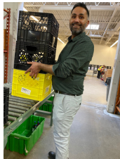
#MakingA Difference! @Harvest @Siloam