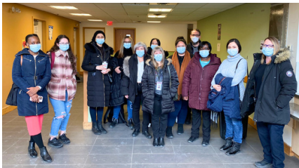
#ExploringTogether @ Mamawi Chi Itata